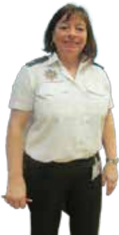
conference fire brigade staff.png