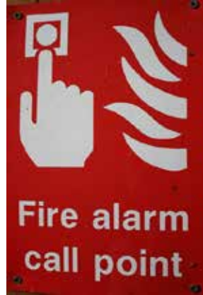
Fire alarm call point sign.jpg