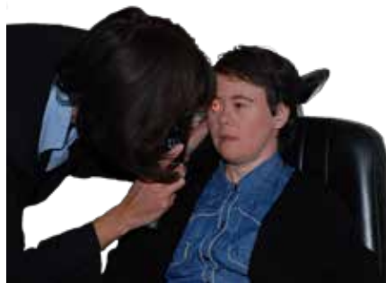
opticians eye test woman.png