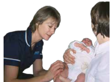
nurse baby health check mother.png