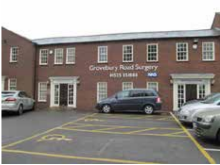
grovebury road surgery doctors.jpg