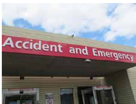
accident and emergency sign.png