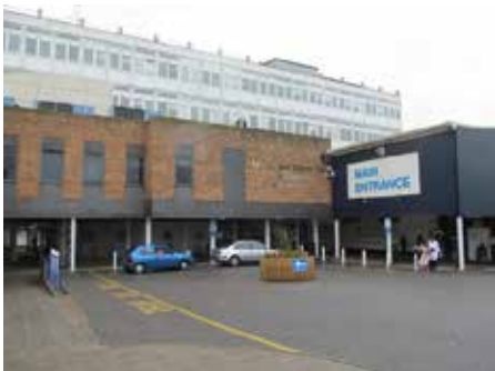
luton and dunstable hospital main entrance.jpg