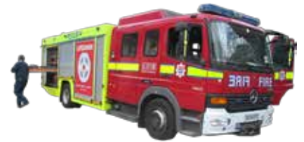
fire truck engine fireman.png