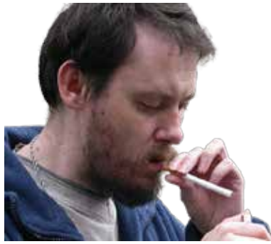
smoking close up.png