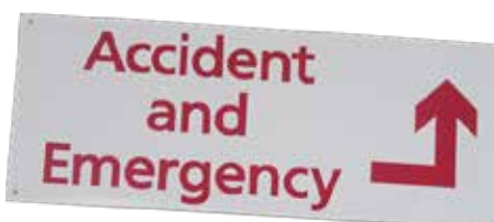
accident and emergency sign this way direction sign.png