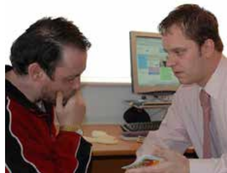
talking with doctor.jpg