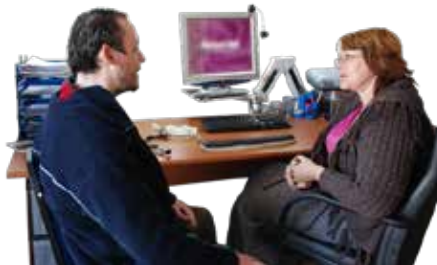
doctors visit 2.png