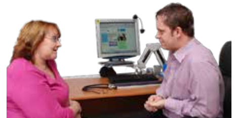
doctors visit 3.png