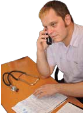
dr on phone.png