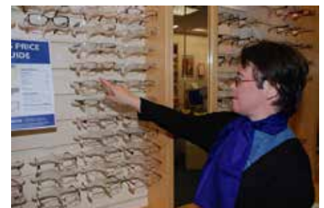
opticians choose glasses point.jpg