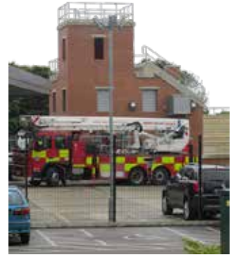
fire engine truck fire station.png