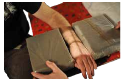
x ray wrist close up.png