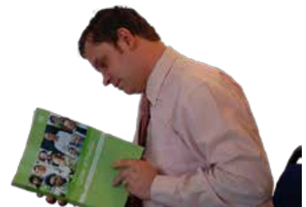
professional codes of practice.png