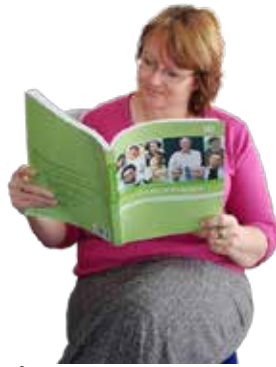
codes of practice.png