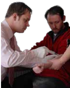
doctors visit job injection.png