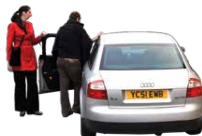
car trip to hospital.png