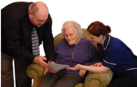
nurse manager home meeting elderly woman.png