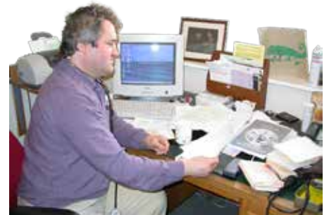
doctor surgery reading notes.png