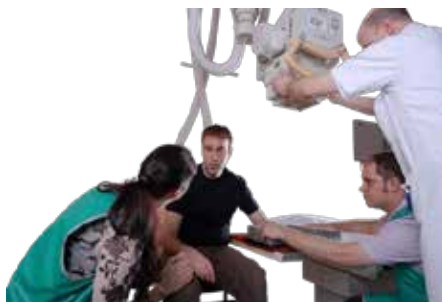
x ray worried.png