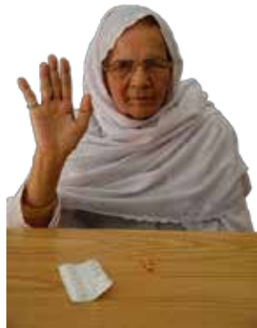
no pills table.png