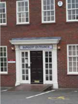
doctors surgery entrance.jpg