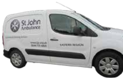
st johns ambulance van.png