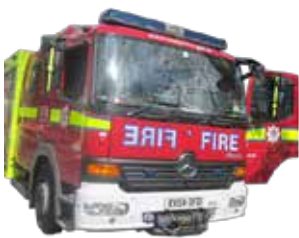
fire truck engine front.png