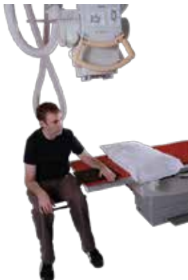
x ray waiting.png