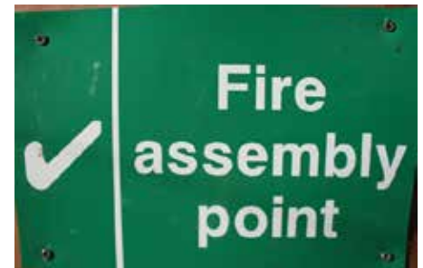
Fire assembly point sign.jpg