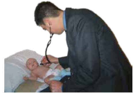
Good GP care doctor baby.png