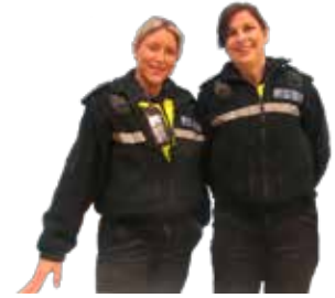
conference ambulance staff.png