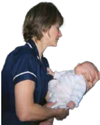
nurse baby Health check.png