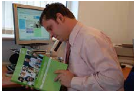
doctor code of practice.jpg