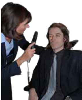
opticians eye test man.png