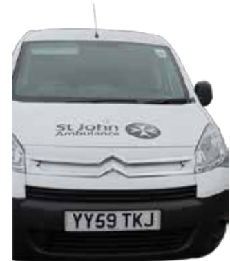
st johns ambulance van front.png