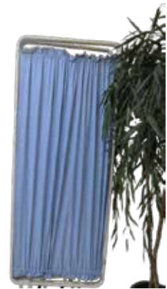
hospital privacy curtain.png