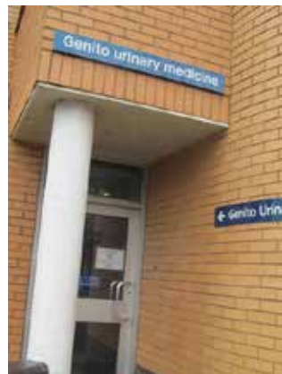
genito urinary medicine entrance.jpg