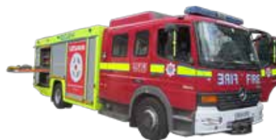
fire truck engine.png