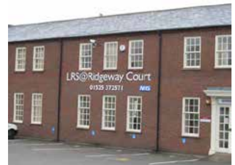
lrs at ridgeway court.jpg