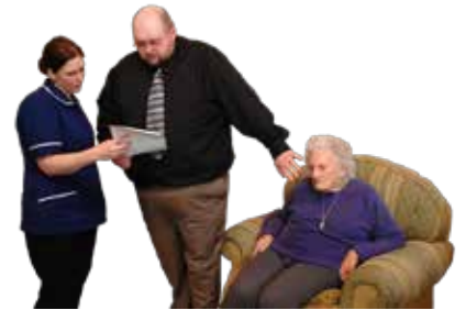
nurse manager home meeting elderly woman not allowed to see information no.png