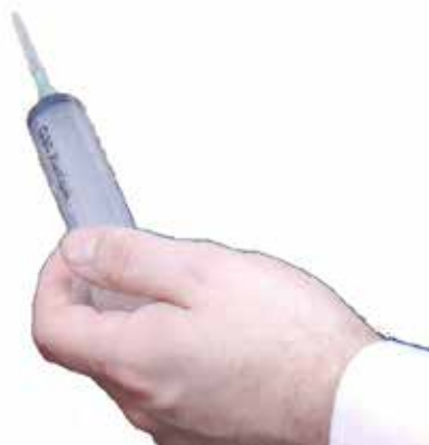
syringe injection empty.jpg