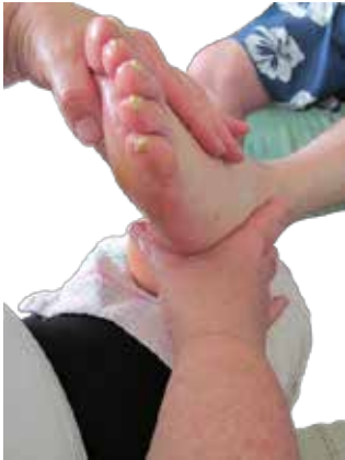
foot feet therapy.png