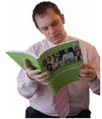
Doctor reading code.jpg