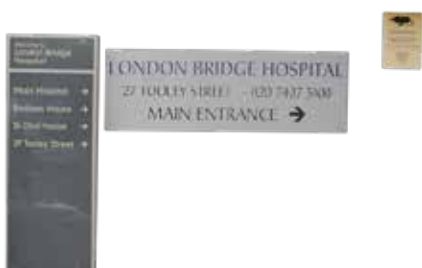
london bridge hospital.png