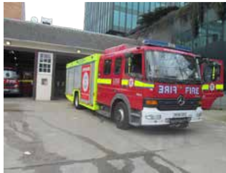
fire truck engine fire station.png