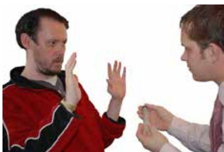
saying no to doctor.jpg