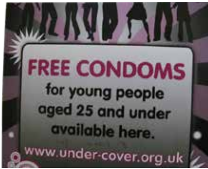
free condoms poster.png