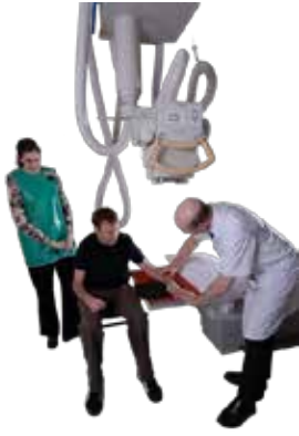
x ray wrist doctor holding arm. png