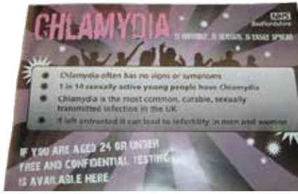
chlamydia information leaflet.png