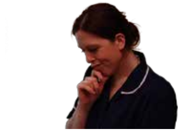
not sure nurse.png