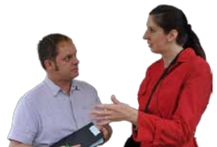
dr and carer.png