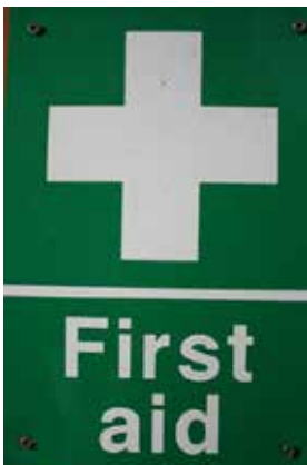
First Aid sign.jpg