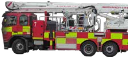
fire engine truck.png