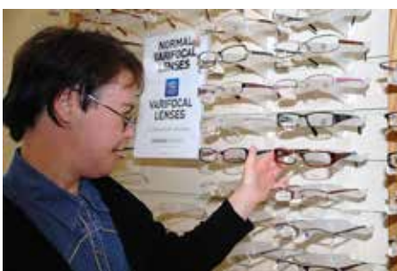
opticians choose glasses.jpg