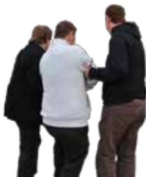
taken to hospital.png