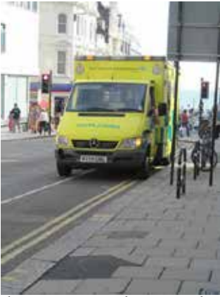
ambulance stopped on road.jpg