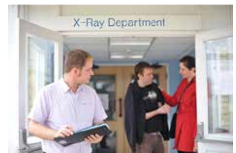
going to x ray department hospital.jpg