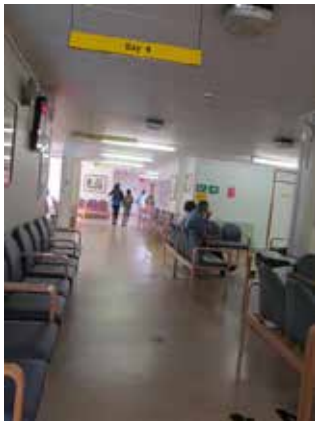
hospital waiting area.jpg