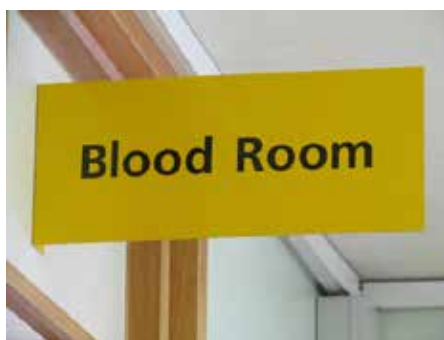
blood room sign.png