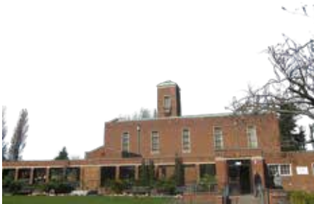
doctors surgery elderly peoples home.png